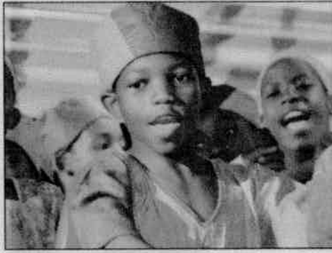
The world acclaimed African Children's choir, Komatipoort , to performed for the sake of education of their brothers and sisters in urban informal settlements. Picture submitted.